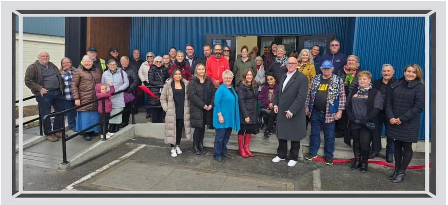
Ribbon Cutting Ceremony for the new building. Nov 22, 2024